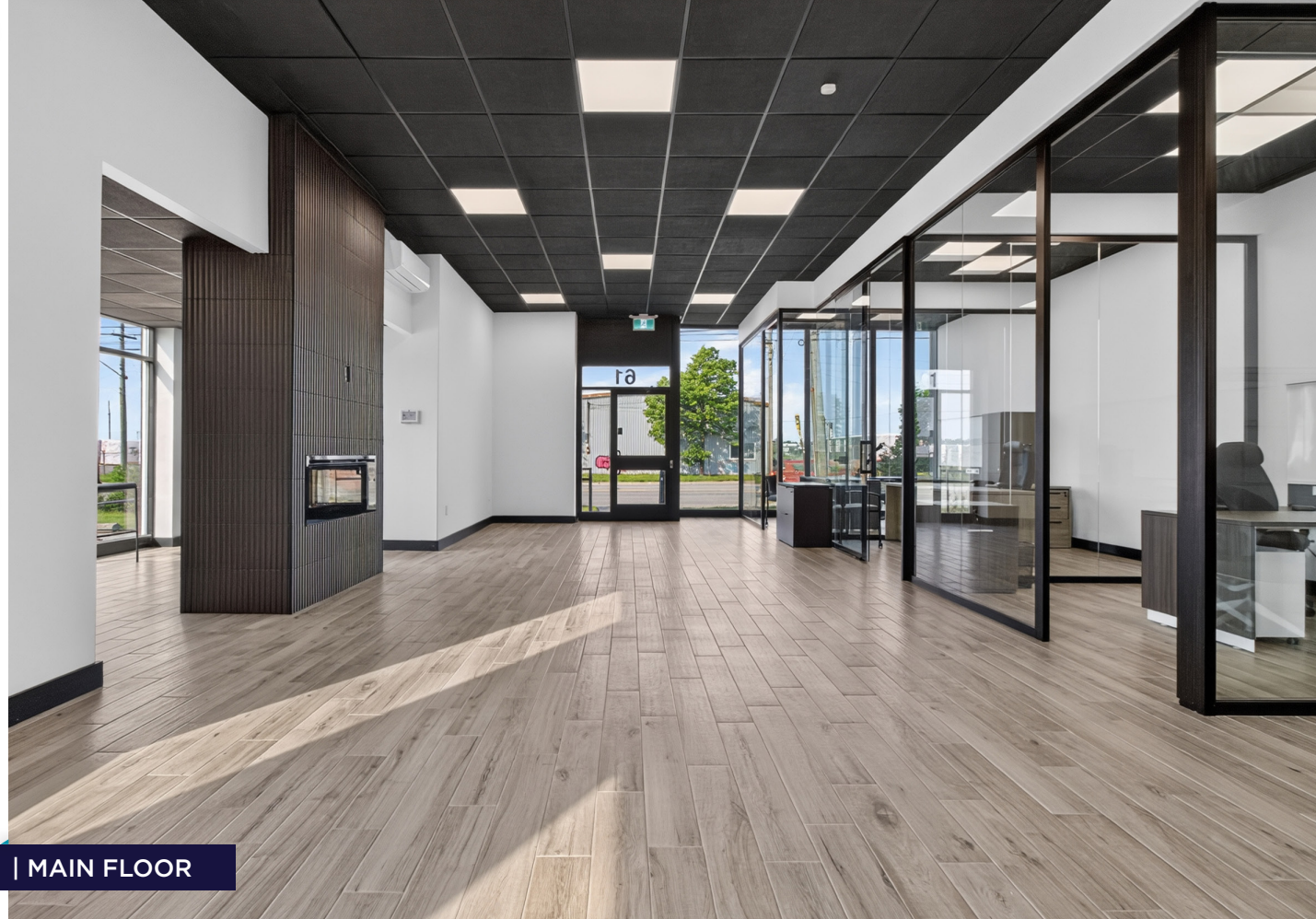
| MAIN FLOOR