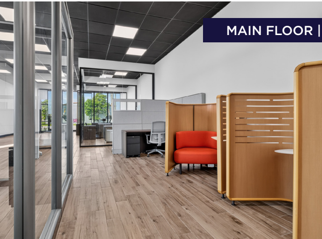
MAIN FLOOR |