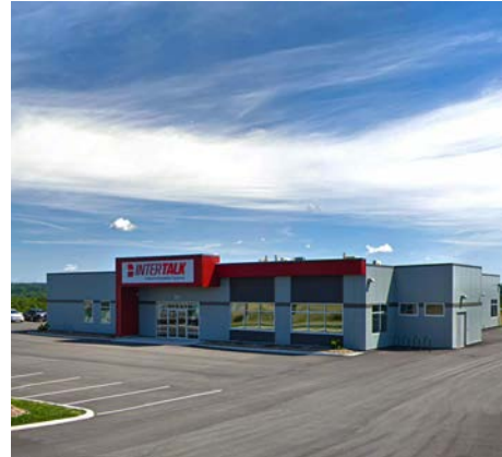
371 CUTLER AVENUE SINGLE TENANT BUILDING DARTMOUTH

Standalone single-tenant office building situated within the Burnside Business Park