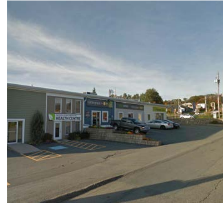
546 SACKVILLE DRIVE 2ND FLOOR OFFICE SPACE LOWER SACKVILLE

2nd floor office space with a practical and efficient layout. Great for professional services, creative teams, and more!