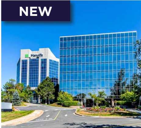
NEW MANULIFE BUSINESS CAMPUS JOSEPH HOWE DRIVE HALIFAX

3-Building office complex in West End Halifax, offering flexible office leasing opportunities