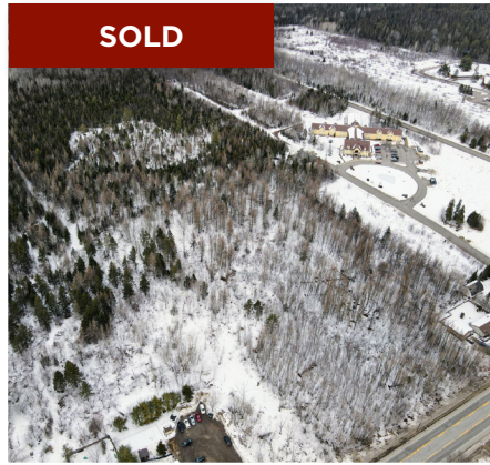
SALISBURY ROAD LAND MONCTON

Exceptional development opportunity in Plaster Rock