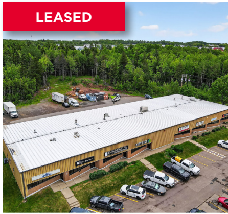
725 CHAMPLAIN STREET SUITE 500 DIEPPE

Versatile and functional flex office / warehouse space.