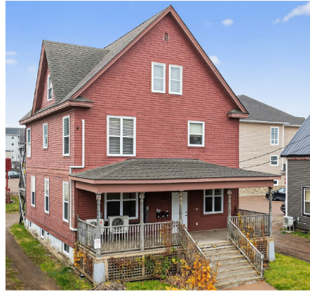
118 HIGHFIELD STREET GROUND FLOOR MONCTON

Ground-floor commercial space, located near Main Street.