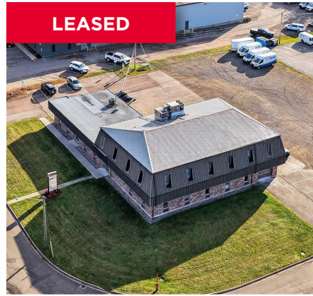
50-60 DRISCOLL CRES SUITE 102 MONCTON

Moncton office with parking, transit access, and flexible workspace.