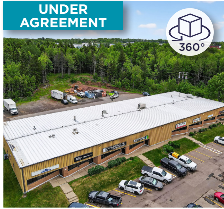
725 CHAMPLAIN STREET SUITE 500 DIEPPE

Versatile and functional flex office / warehouse space.