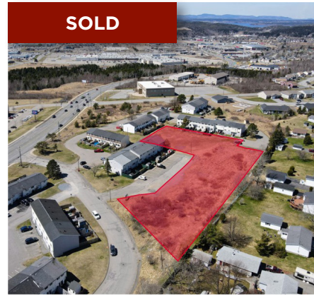
HIGHMEADOW PARK SAINT JOHN

Prime multi-unit residential development opportunity.