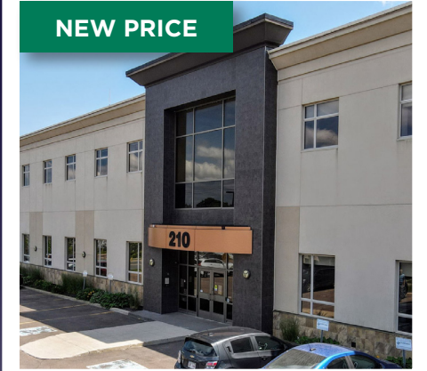
210 JOHN STREET MONCTON

Two-storey professional office building with 10,000 sf available.