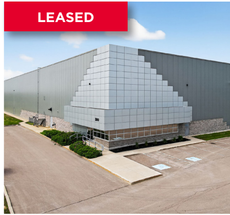
280 DESBRISAY AVENUE MONCTON

State-of-the-art warehouse in Moncton Industrial Park.