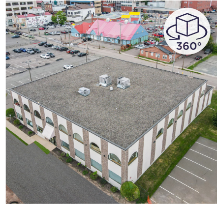
123 LUTZ STREET MONCTON

Versatile layout with a blend of retail, warehouse, and office space.