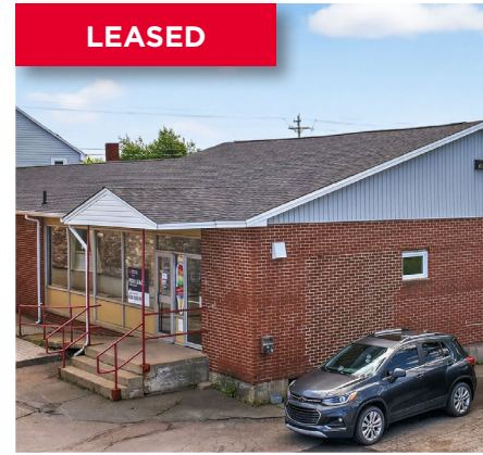
334 MAIN STREET UNIT B1 SHEDIAC

Multi-tenant commercial space in an ideal location with three suites, storage, a private kitchen, and a restroom.