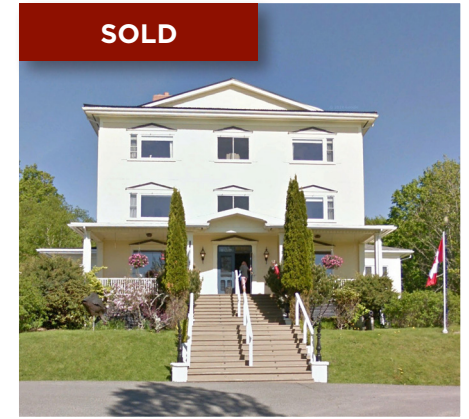
ROSSMOUNT INN HOTEL ST. ANDREWS

Thriving boutique hotel & 82.5 acres of land.