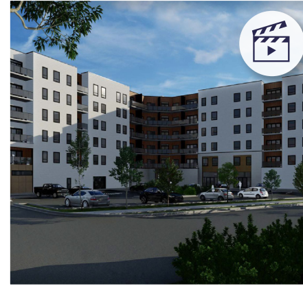
1333 MAIN STREET MONCTON

Ground floor commercial space in Downtown Moncton with on-site parking.