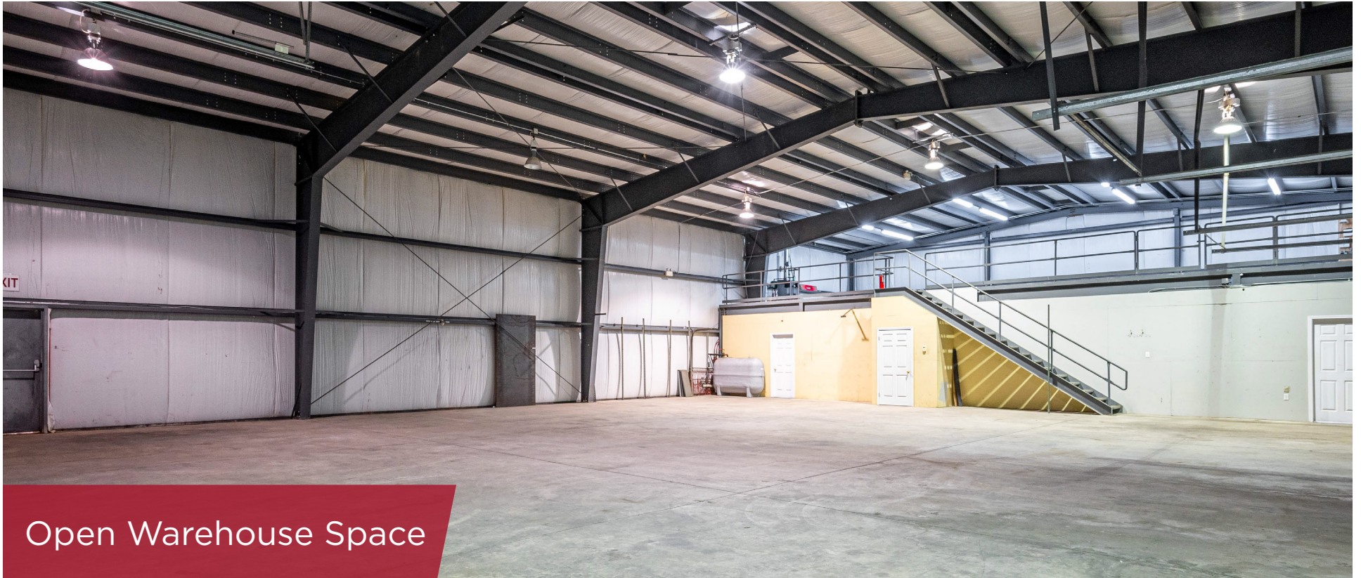
Open Warehouse Space