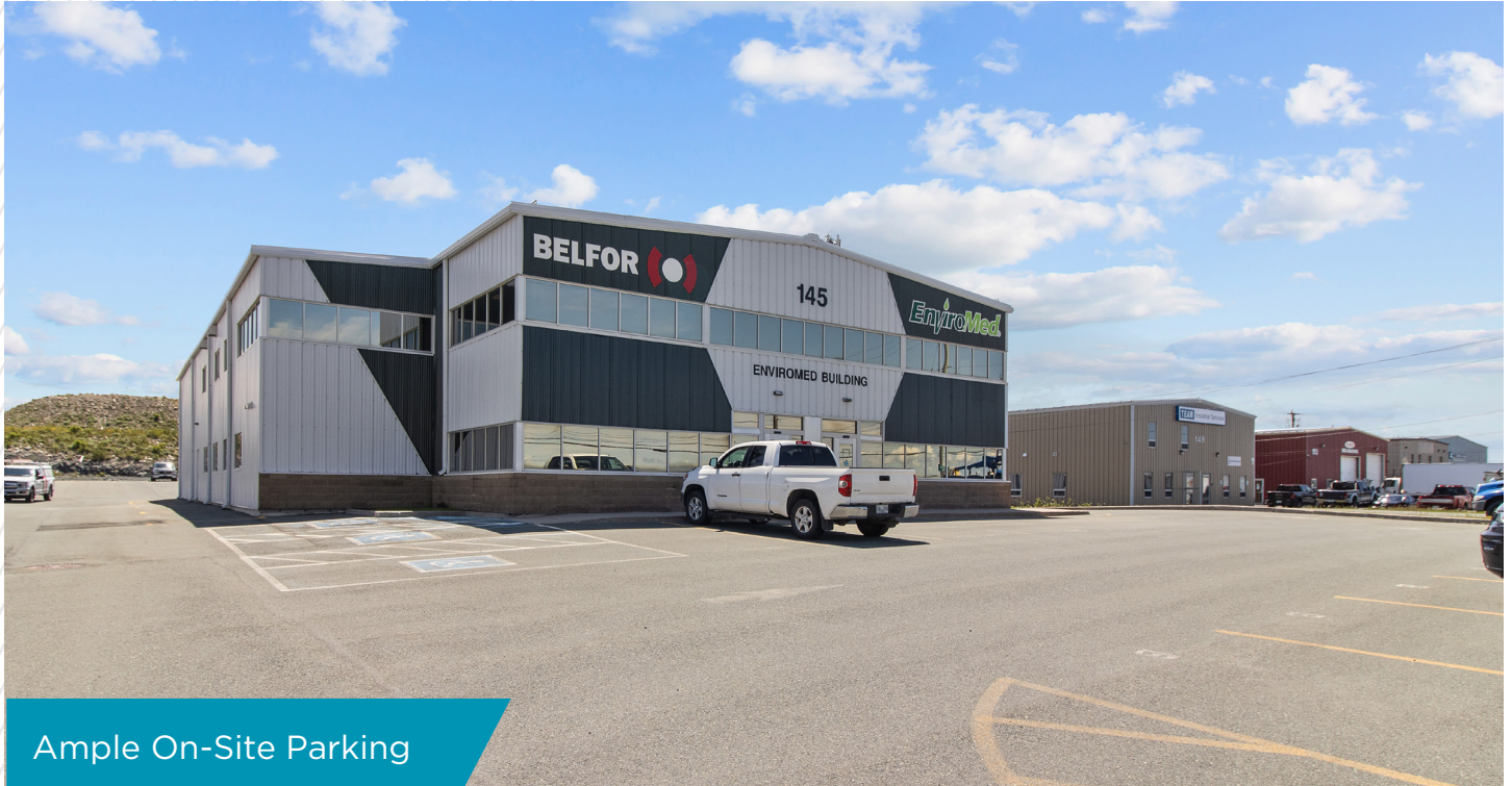
Ample On-Site Parking