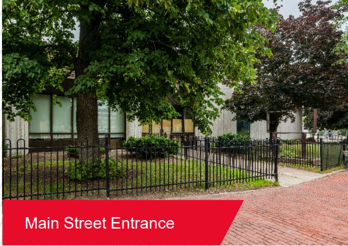
Main Street Entrance