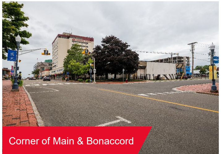
Corner of Main & Bonaccord