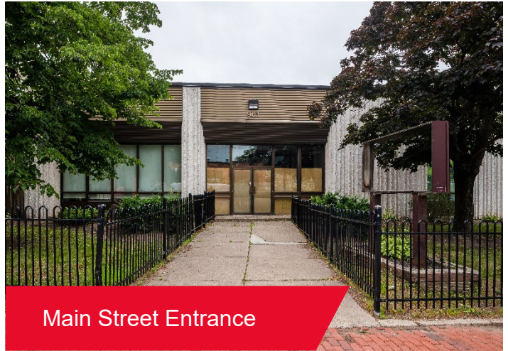
Main Street Entrance