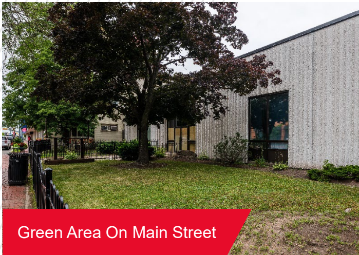
Green Area On Main Street