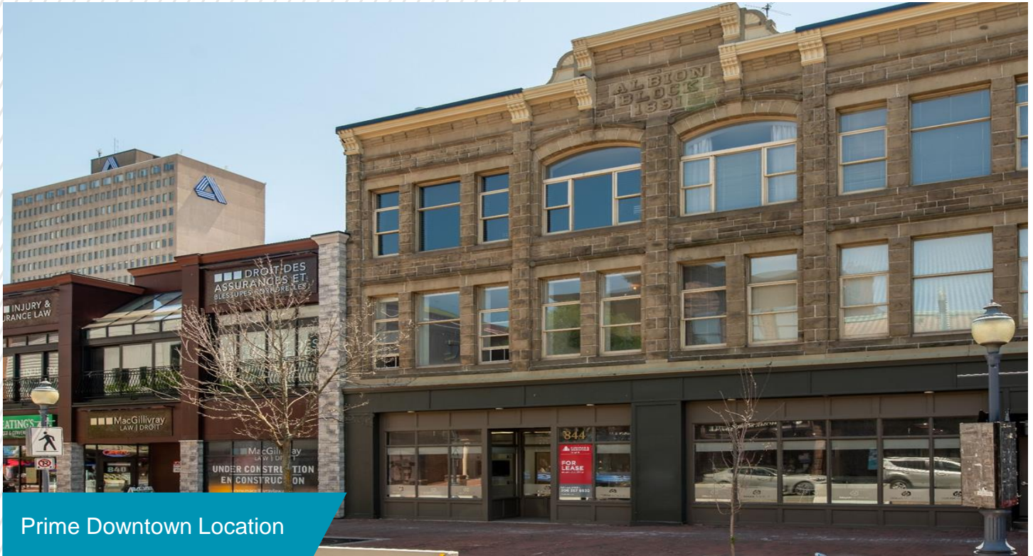
Prime Downtown Location